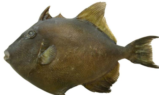
Finescale Triggerfish - 2014

http://biogeodb.stri.si.edu/sfstep/en/pages/random/3175