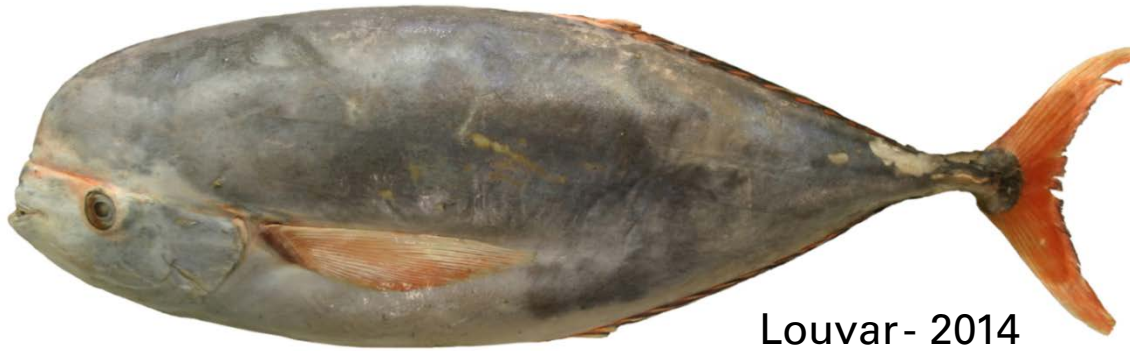
Louvar - 2014

http://biogeodb.stri.si.edu/sfstep/en/thefishes/species/1059