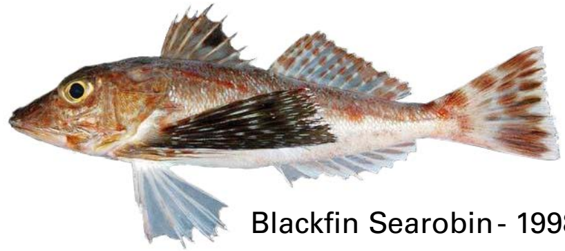
Blackfin Searobin - 1998

http://biogeodb.stri.si.edu/sfstep/en/thefishes/species/1059