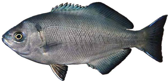
Halfmoon - 1979

http://biogeodb.stri.si.edu/sfstep/en/pages/random/3175