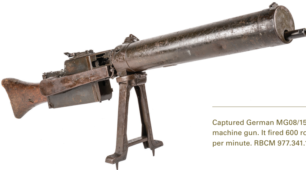
Captured German MG08/15 light machine gun. It fired 600 rounds per minute. RBCM 977.341.1.