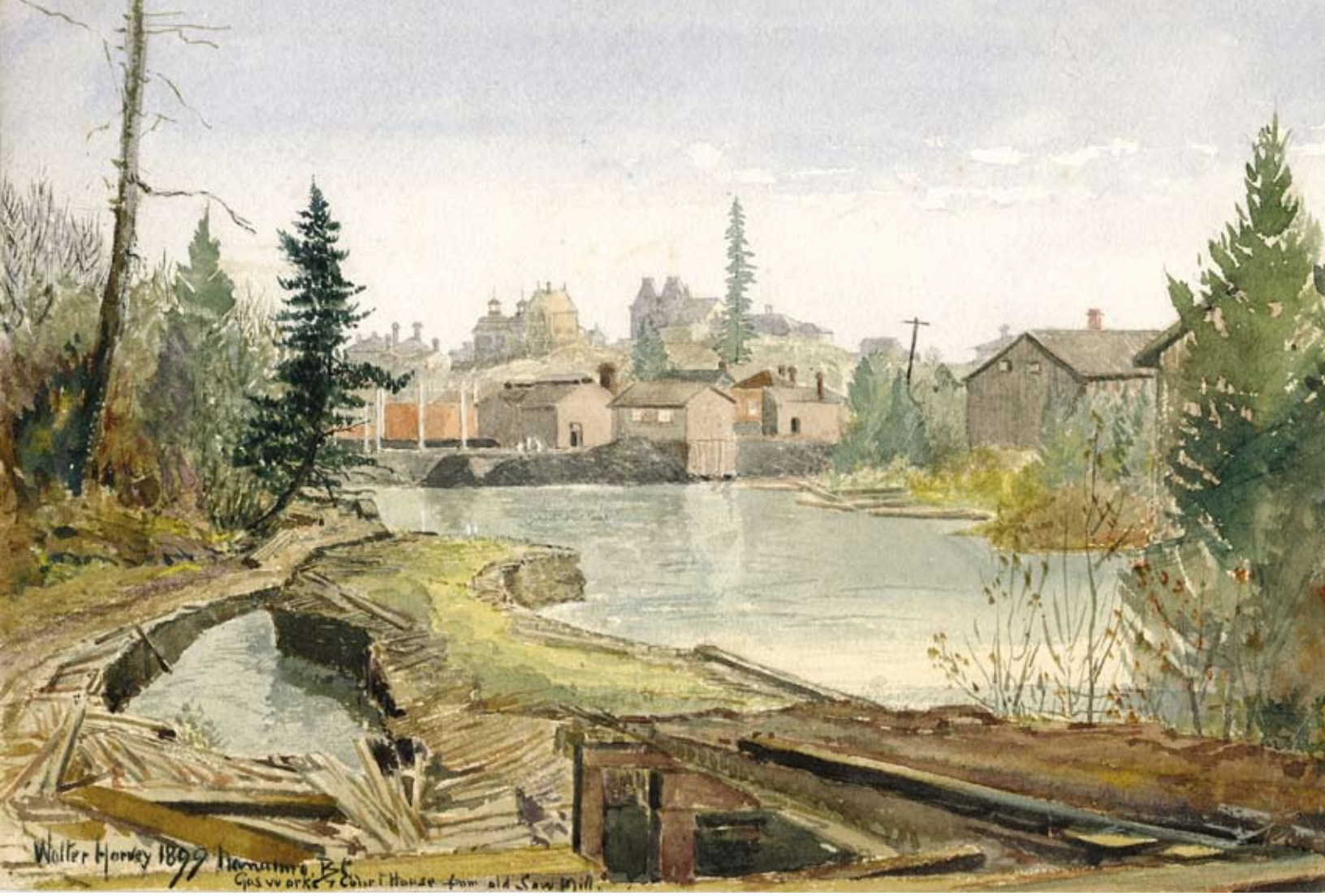
Walter Harvey's watercolour painting of Nanaimo in circa 1900.

a development department that would focus specifically on fundraising for the Corporation.