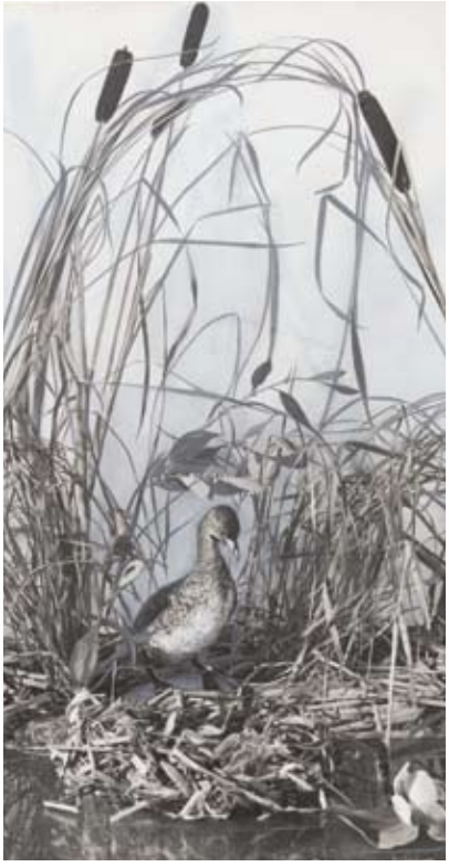
This early diorama features a nesting Pie-billed Grebe.

The RBCM is responsible for the stewardship of more than 7 million artifacts, documents and specimens of BC's natural history and human history. For more than 120 years, the staff, curators, archivists and directors at the museum and archives have taken on that responsibility with reverence and passion.