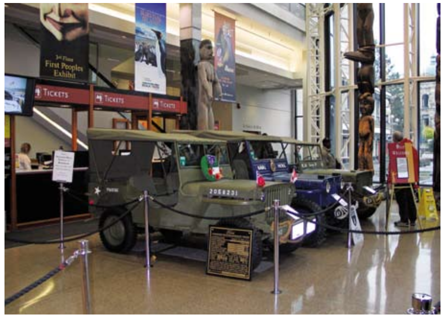
Three jeeps from the Western Command Military Vehicles Historical Society in Victoria greeted visitors during the RBCM's Remembrance Commemorations, November 4–11, 2006.

A new species for Canada. Canadian Field Naturalist.