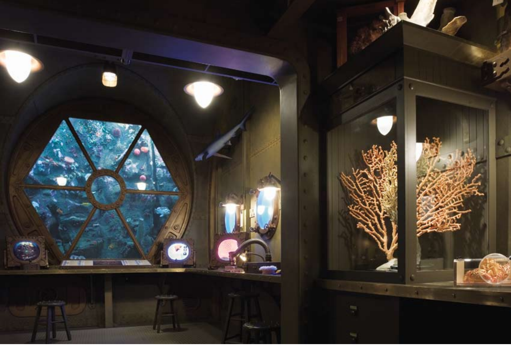
Ocean Station: the RBCM's newest permanent exhibit.

draw on science developed and advanced at the RBCM to portray scenarios set 60, 80, even 100 years in the future. These films highlight the important role of the RBCM in expanding our shared understanding of the province's natural environment and the impact people have on it.