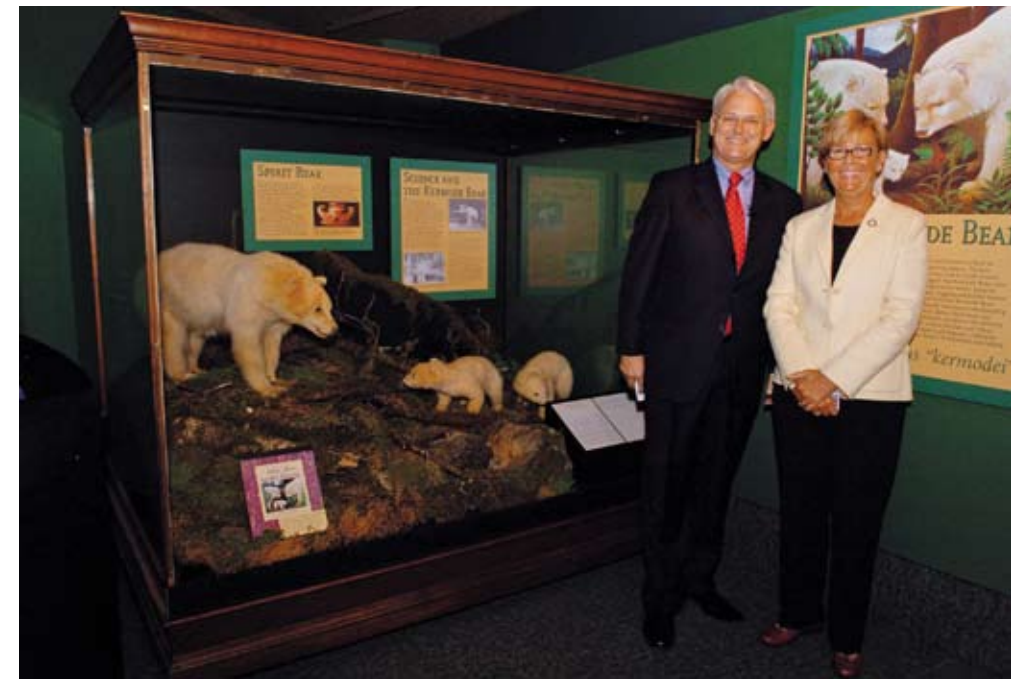
Premier Gordon Campbell and RBCM CEO Pauline Rafferty unveil the Kermode bear display in the Natural History Gallery, April 4, 2006.

Illumination of a different variety was the subject of another stewardship initiative in 2006-2007, the creation of a new lighting plan for the First People's galleries on the third floor of the museum. More than 30 years after their installation, the original lighting fixtures in these permanent galleries have reached the end