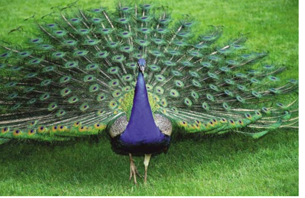
In Fatal Attraction, the peacock's fan tail presented an example of the risks an animal takes to attract a mate.

The photographs were taken by Charles Francis Sherwin, the mine superintendent.