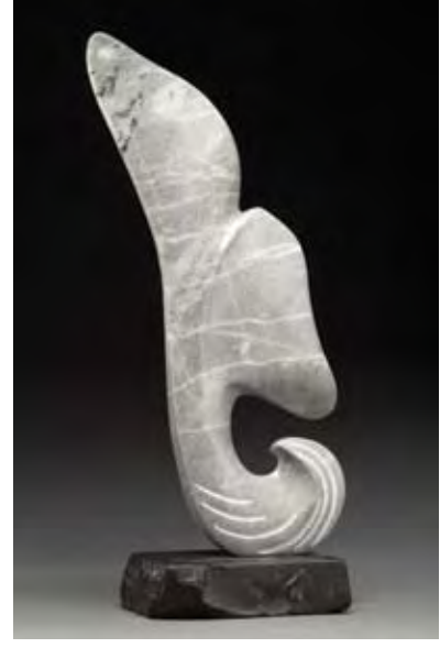
Tourism Victoria Miracle Award

All of this economic activity makes a critical difference in the lives of working individuals, their