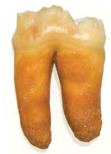
A molar from the first Short-faced Bear (Arctodus simus) remains to be discovered in British Columbia. The find was made this past year at Pellucidar Cave.

Innovative and entrepreneurial, the Royal BC Museum is engaging the public in bold new ways, attracting new support and investment that will be vital to its future success. With continued strong support from the Province, these additional resources will help the RBCM move closer to realizing its vision of a revitalized cultural precinct in the heart of BC's capital city.