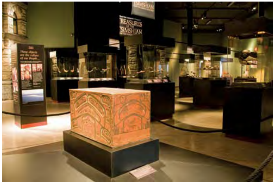
Treasures of the Tsimshian from the Dundas Collection.