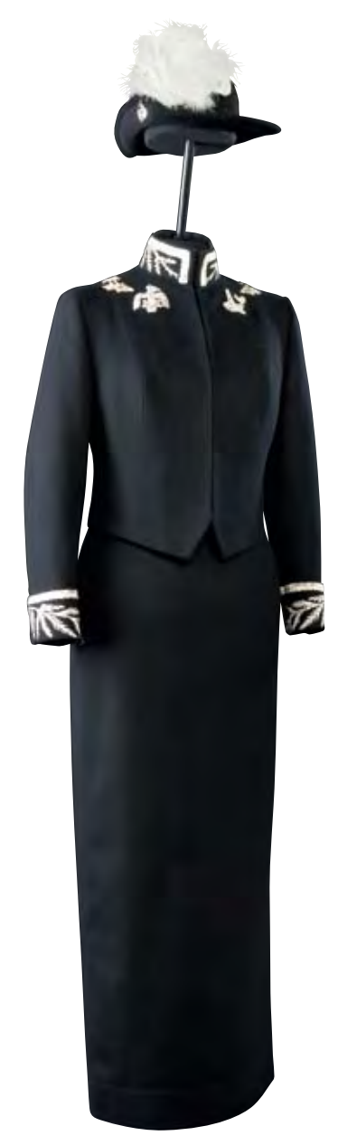
Iona Campagnolo, lieutenant governor from 2001 to 2007, designed her elegant uniform to reflect the unique character of British Columbia.

consists of 13 volumes of textual records, 1910-1954. The records are personal diaries or notebooks kept by Norman Charles Stewart (1885-1965), a land surveyor qualified under both the federal and provincial land survey systems. He served as the British Columbia Surveyor General between 1947 and 1950. The set of diaries are