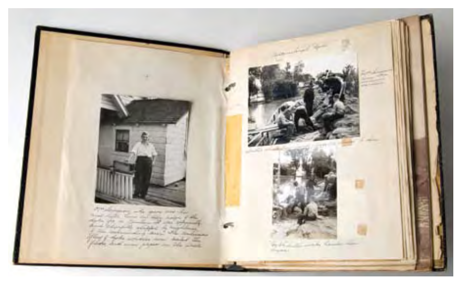
Pages from Phyllis Munday's photo album.

consists of 13 volumes of textual records, 1910-1954. The records are personal diaries or notebooks kept by Norman Charles Stewart (1885-1965), a land surveyor qualified under both the federal and provincial land survey systems. He served as the British Columbia Surveyor General between 1947 and 1950. The set of diaries are