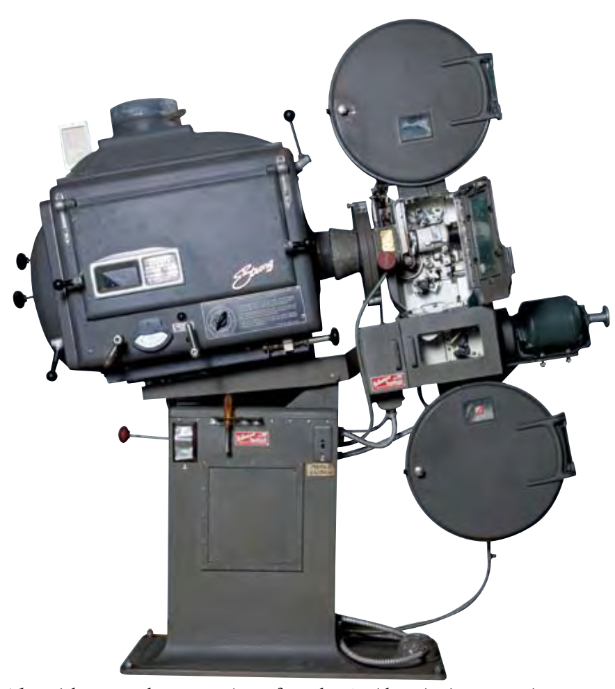
The Mighty 90 carbon-arc projector from the Cassidy Drive-in at Nanaimo.

The 2007-08 year also saw RBCM staff undertake a great deal of