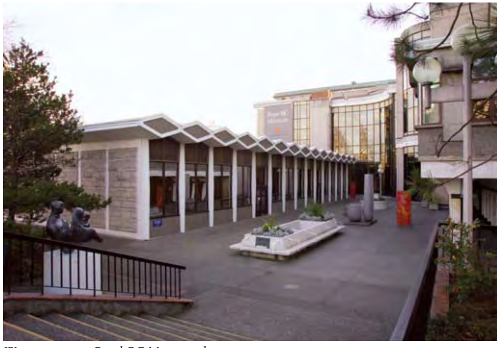
West entrance to Royal BC Museum plaza.

Whether they were sharing stories and objects, volunteering or simply visiting RBCM facilities in Victoria, British Columbians made it clear last year that they want to be more involved in their provincial museum and archives. And the