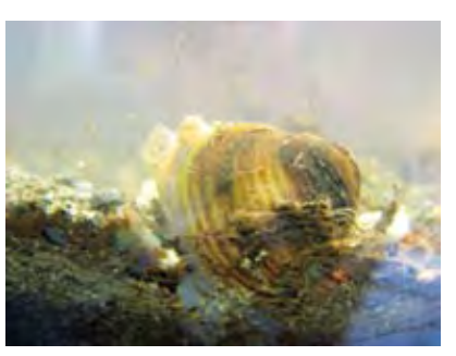
The Asiatic clam, one of the most aggressive freshwater invaders worldwide.

Drumming Katydid. A European native, the Drumming Katydid, has been established in northeastern North America since 1957, and this cricket is now firmly established in BC's Lower Mainland. Surprisingly, although students at Simon Fraser University and the University of BC had collected a few specimens as far back as 1991, no one had reported this immigrant until RBCM entomologists recently recognized it as unusual. Several specimens from the Vancouver area were accessioned into the RBCM insect collection in 2007.