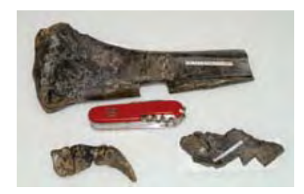
Ornithischian dinosaur bones from the Sustut Basin in north-central British Columbia.

year-old remains of a short-faced bear, a long-extinct species never known before from BC, were found as part of a Royal BC