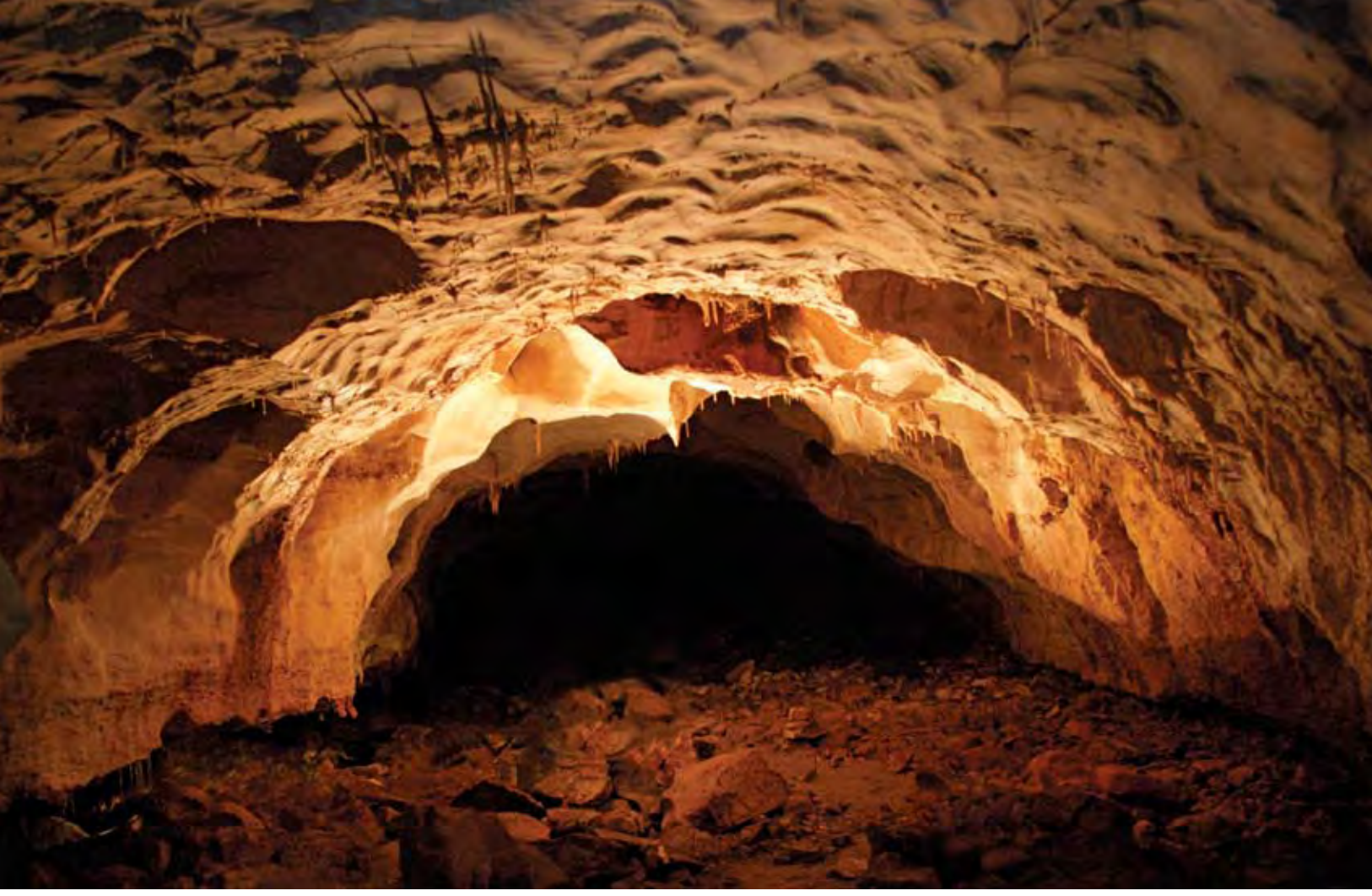
Inside Pellucidar Cave, where the skeletal remains of a Short-faced Bear (Arctodus simus), a species that is now extinct, were recovered by RBCM scientists.