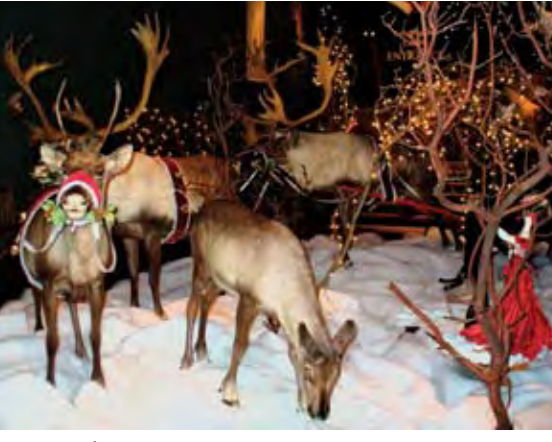
"On Dasher, on Dancer, on Prancer, on Vixen...."