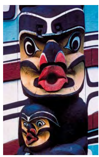
Detail of Kwakwaka'wakw Heraldic Pole in Thunderbird Park.

Aging infrastructure present risks to the documents, artifacts and specimens the RBCM holds in trust for all British Columbians on behalf of the Province. These risks include fire, water damage and degradation caused by instability in temperature and humidity control.