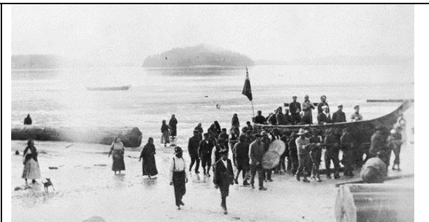
Guests arriving for a potlatch at Opitsat and being carried ashore in their canoe while being welcomed with a song.